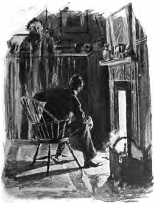
“THE DEMON VANISHED”